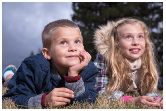
Youth ages 8 to 19 as of January 1 of the program year are eligible to be Michigan 4-H members.

This policy change has been implemented by MSU Extension after lengthy consultation with early childhood and Michigan 4-H youth